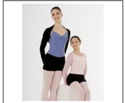
Leotard & Boy Short