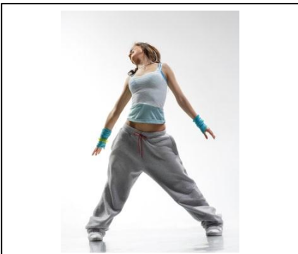
Tank & Sweatpants