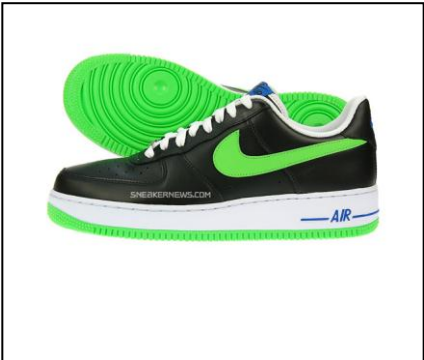
Hip Hop Example 1