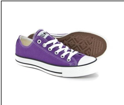
Hip Hop Example 2