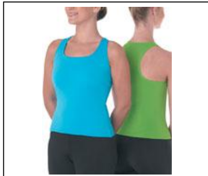
Tight Fitting Top