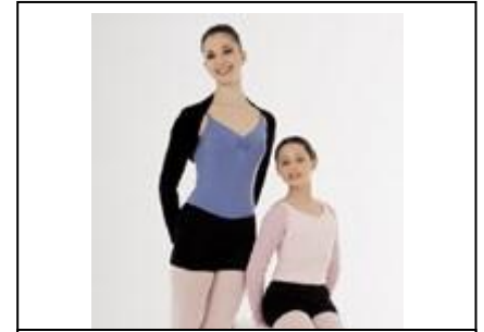
Leotard & Boy Short